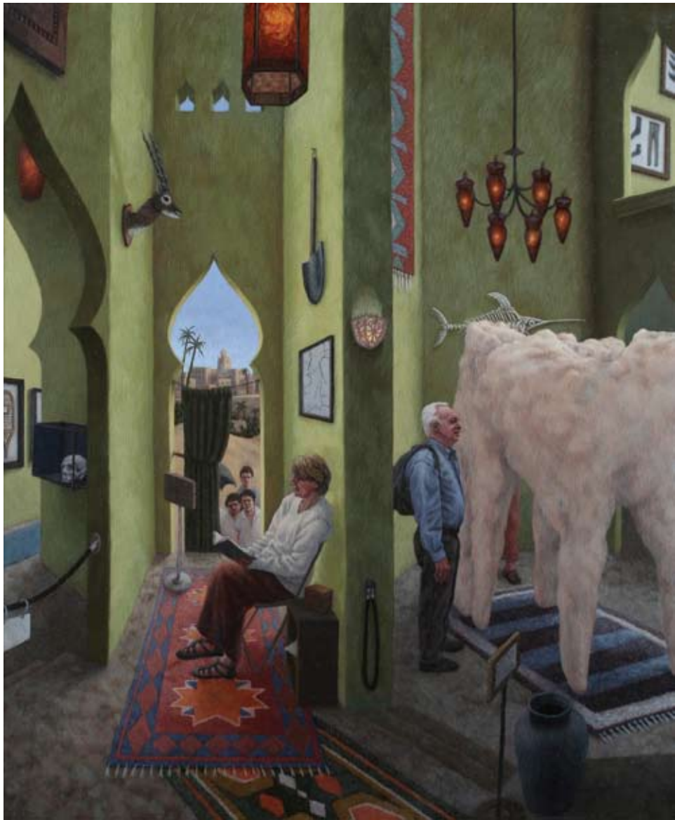
Marco Polo Visits the Museum at Soncara (2005), 11" × 9", oil on panel