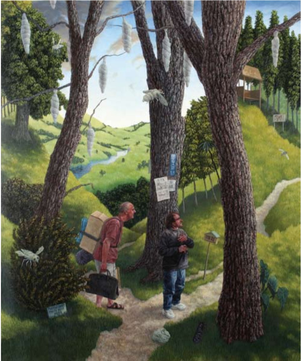
Marco Polo and His Porter, Lost (2001), 12 1/2" × 10", oil and acrylic on panel