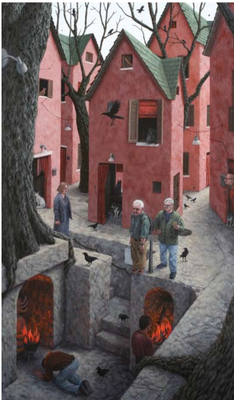
Marco Polo Among Idol Worshipers (2005), 13 1/2" × 8", oil on panel