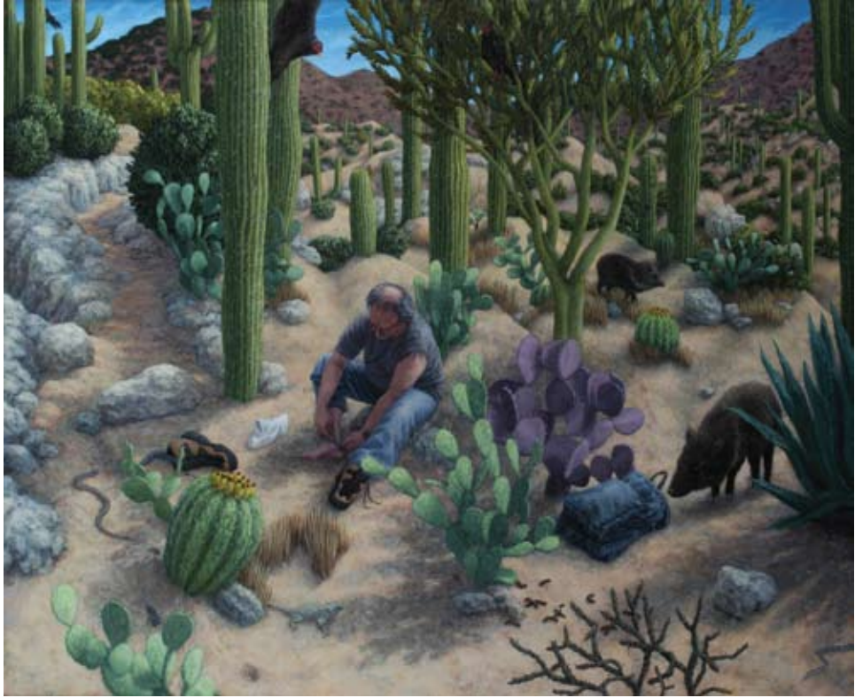
Marco Polo Gets a Blister from New Shoes (2002), 9" × 11", oil and acrylic on panel