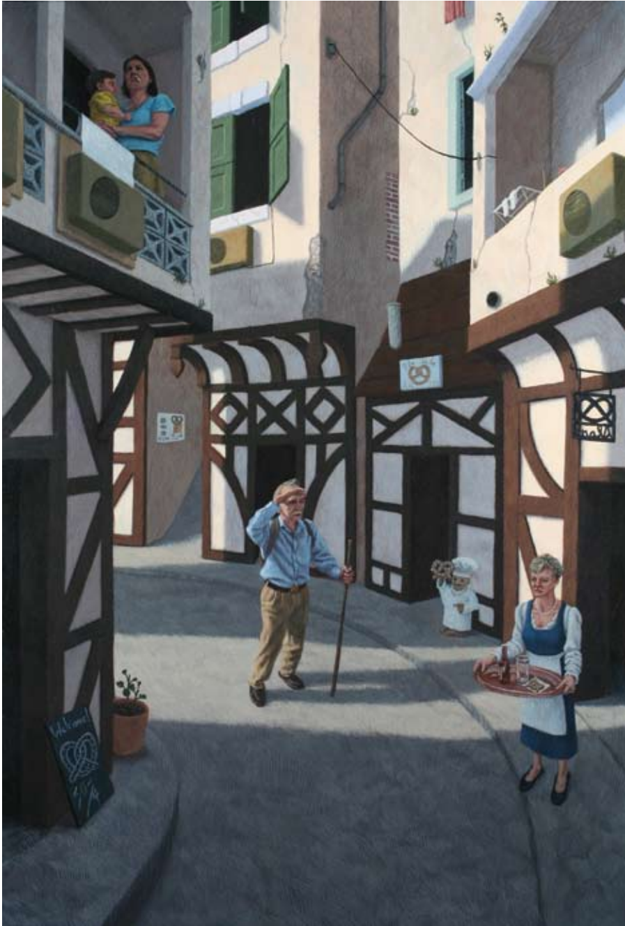
Marco Polo Arrives at Samarcand (2007), 12" × 8", oil on MDF