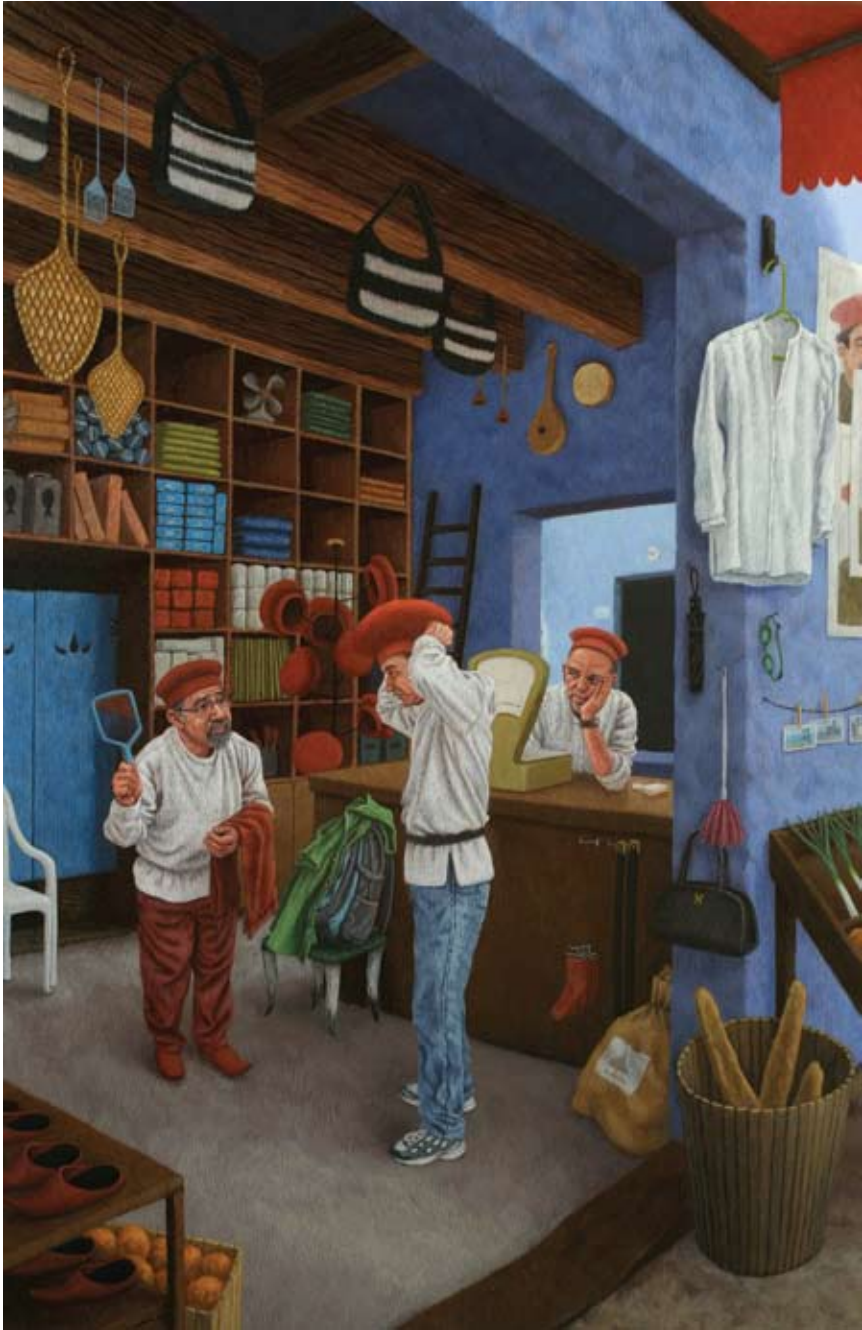
Marco Polo Shopping (2006), 12" x 8", oil on MDF