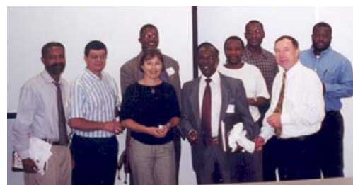
Food Security Seminar - UGA