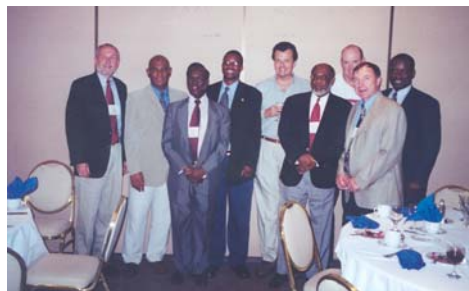
At the AAEA meeting in Long Beach, CA.