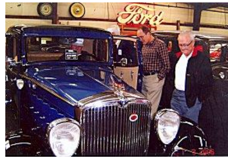
George Bugg's extensive private collection of restored antique cars.