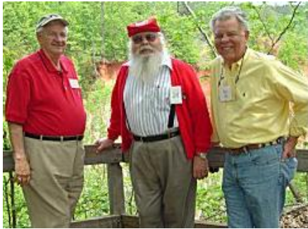
West Georgia Trip: Providence Canyon; Historic Westville Village; Americus; Andersonville Prison and Cemetery; and Plains