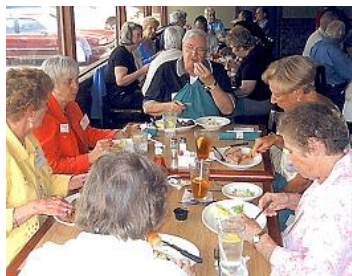
Lunch on the Flat Rock Play House trip